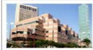
◆ Taipei International Convention Center

The TICC brings a comprehensive range of business resources within easy reach of event-goers. TICC facilities include product displays, world-renowned trade exhibitions, information and consulting services, as well as deluxe hotel accommodations.